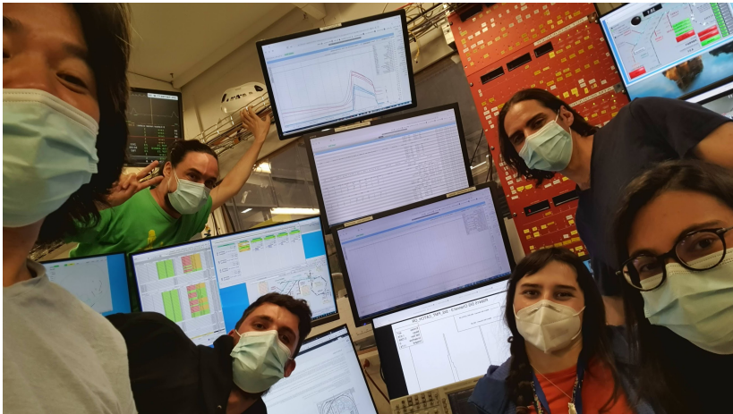
Happy shift crew (mostly students and postdocs) in the ALPHA Control Room