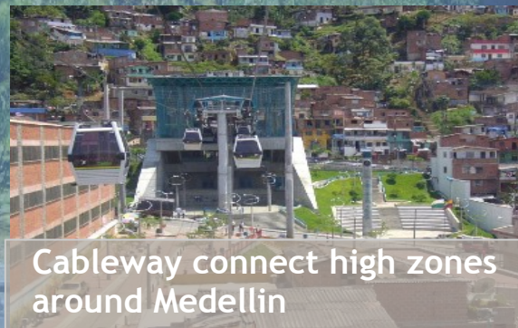
Cableway connect high zones around Medellin