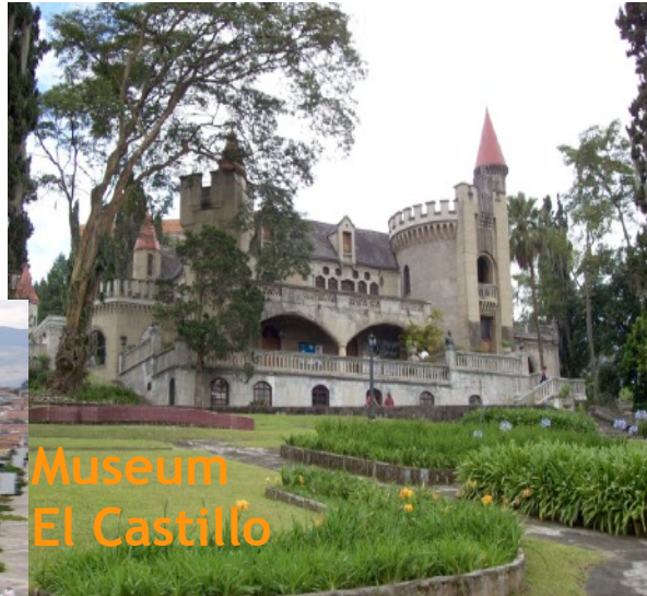
Museum El Castillo