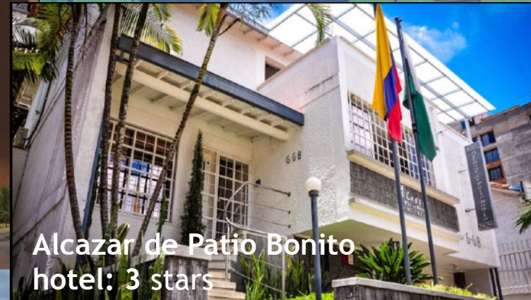
Alcazar de Patio Bonito hotel: 3 stars