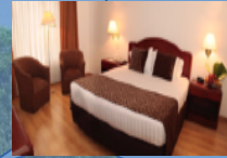
Poblado Plaza hotel: 5 stars, discounts with UdeM