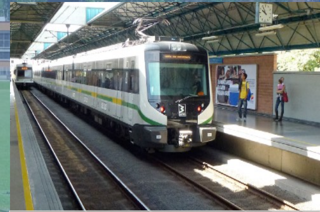
Metro system connects North, South and west zones