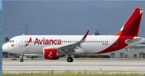
JMC International airport 50 min away from Medellin

Medellin has one of the best transportation system in South America!!