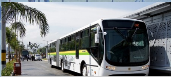
Metroplus are long buses with a final station on UdeM