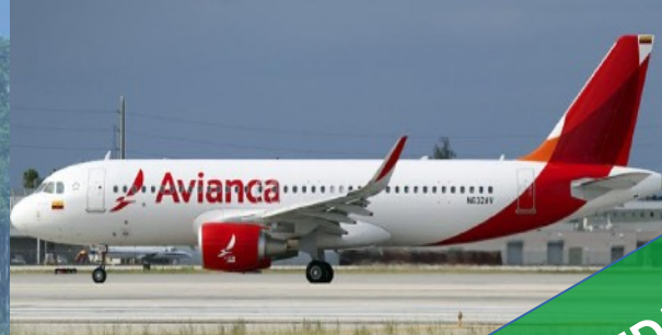
JMC International airport 50 min away from Medellin

Medellin has the best transportation system in South America!!