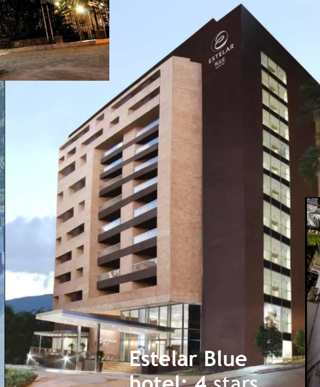
Estelar Blue hotel: 4 stars