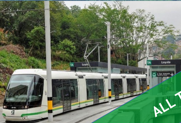
Streetcar system from center to East of Medellin