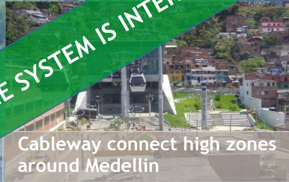
Cableway connect high zones around Medellin