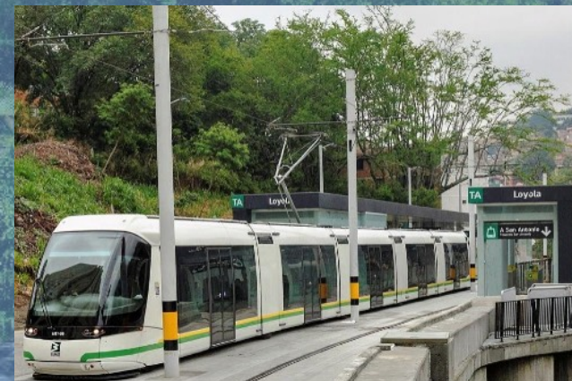
Streetcar system from center to East of Medellin